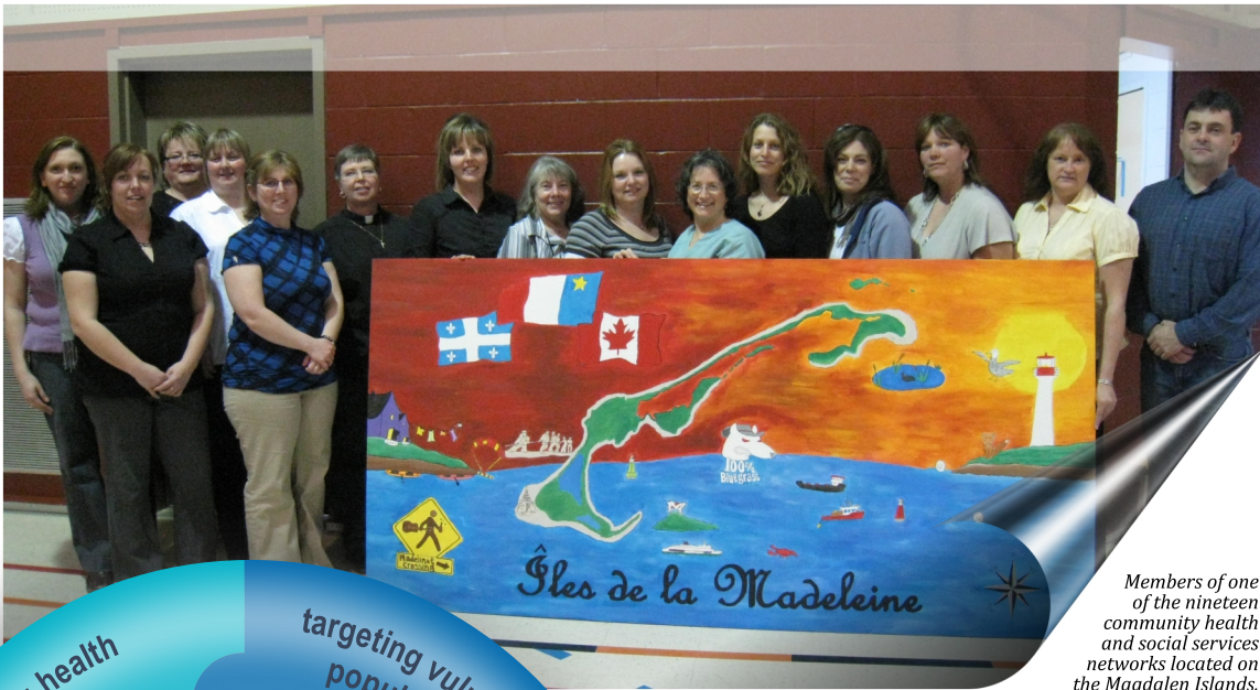
Members of one of the nineteen community health and social services networks located on the Magdalen Islands.

These community health and social services networks implement three key action strategies: improving access to health and social services, increasing the availability of health promotion and disease prevention programs, and fostering social innovation. They engage a broad range of local partners in an intersectoral networking and partnership approach to take action on priority health determinants, focussing on specific populations. This work is rooted in a number of principles and values that guide the development of the networks, with the ultimate aim of improving the health and well-being of English-speaking communities in Quebec and enhancing community vitality.