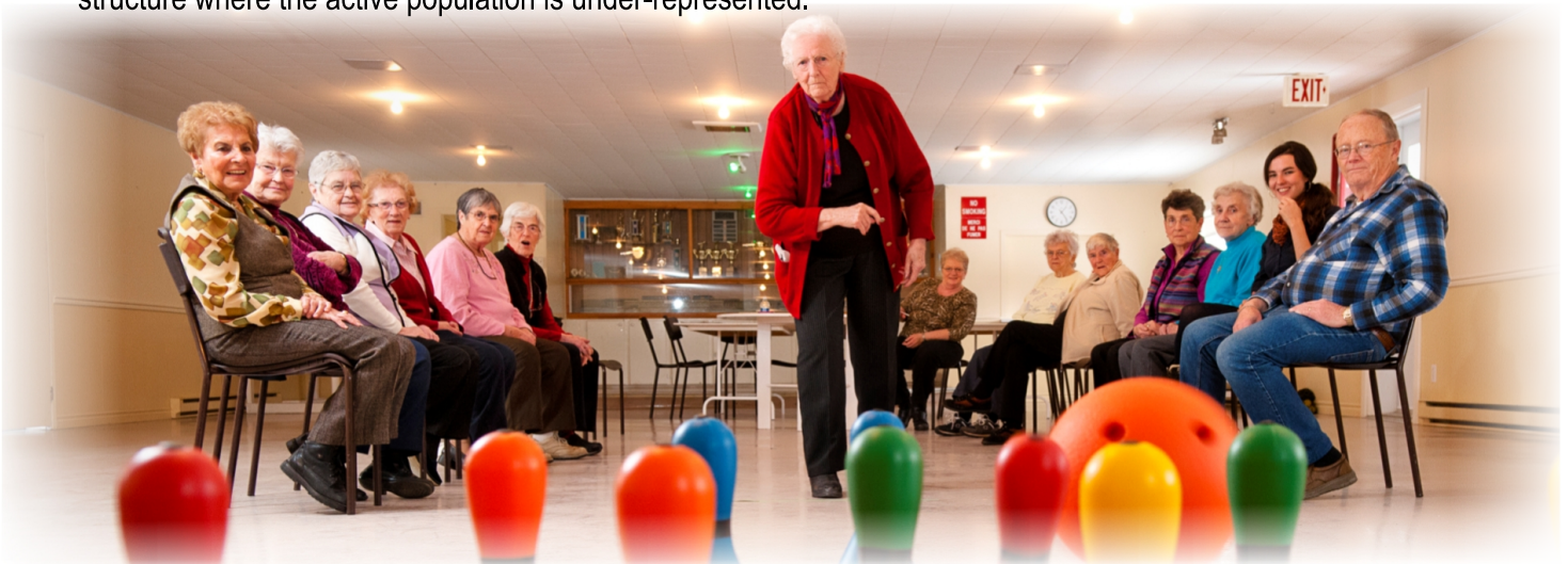
English-speaking seniors participating in wellness centre activities in the Baie-des-Chaleurs.

Since the proportion of Quebec's mother tongue English population has declined over the years, and because those who left were mostly young and middle-aged, the English-speaking population has a large proportion of seniors 3 . For example, from 1996-2011 the population over 40 years of age increased by an average of 36% and among those aged 75 or over, the increase was 37% 4 . Over the same period, the population of English speakers between 25 and 40 years of age decreased slightly, leaving fewer care-giving supports for the elderly. This situation can have a significant impact on the health of both the seniors and those who care for them, as caregivers may find themselves overburdened with multiple responsibilities. Community development efforts may also be hindered by an age structure where the active population is under-represented.