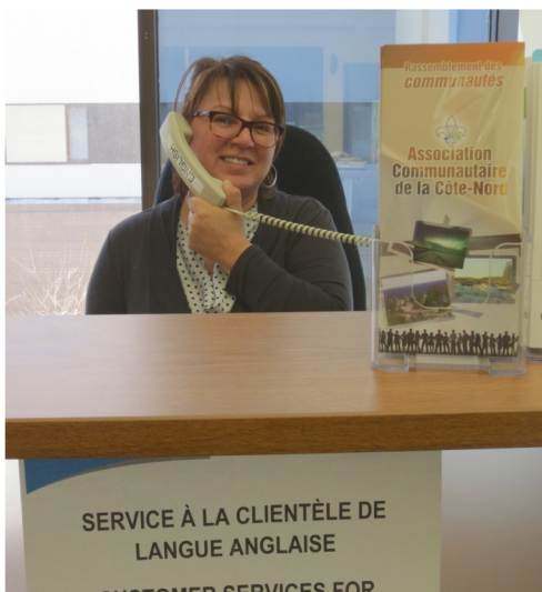
A customer service agent for the Health and Social Services Centre (CSSS de Sept-Îles) dedicated to helping the English-speaking community navigate the health system in her region.

Access to health and social services can be affected by language barriers between service providers and clients. This can result in inequalities in health status because problems in communication and understanding reduce the use of preventative services, increase the amount of time spent in consultations and diagnostic tests, and influence the quality of services where language is an essential tool—such as mental health services, social services, physiotherapy and occupational therapy. Language barriers also reduce the probability of compliance with treatment and diminish the level of satisfaction with the care and services received 8 . Among English-speaking Quebecers, access to health and social services remains a challenge for many, in spite of the fact that rates of bilingualism in this group are on the rise, and English speakers are more likely than other language groups to be able to converse in both English and French 9 . There is also a wide variation in accessibility and quality of health and social services in English across the province 10 . This includes institutional documents in English such as consent forms, treatment follow up information and website access.