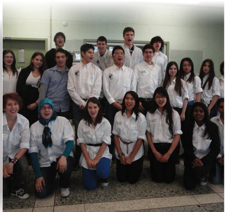
Youth leaders from Laval Liberty High School participated in organizing a community health forum in Laval.